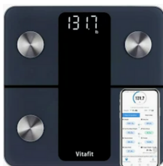
Smart Scales for Body Weight and Fat Percentage